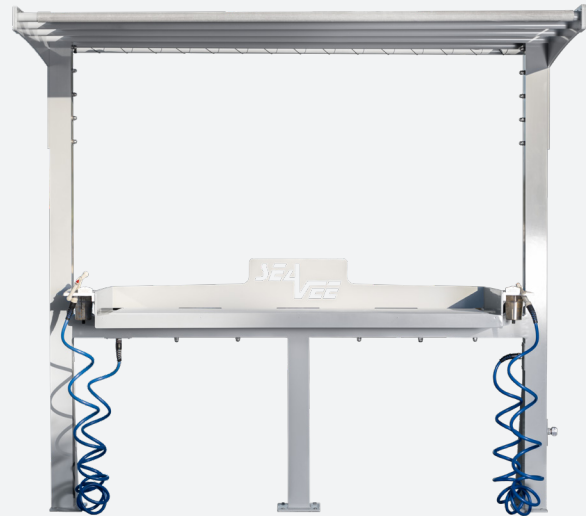
Pictured: 7 Ft Table + Awning