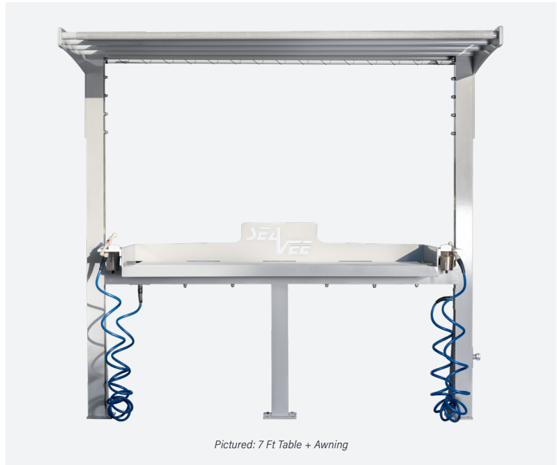
Pictured: 7 Ft Table + Awning